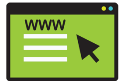
Self-Referral for Test

Anyone who tests positive will be contacted by the Contact Tracing Service in the Public Health Agency and will need to share information about their recent interactions. This could include household members, people with whom you have been in direct contact, or been within 2 metres for more than 15 minutes. Passing in corridors and short periods of contact does not therefore present a significant risk to staff or young people. All household members should follow PHA isolation guidance which currently requires everyone in the house to stay at home. The guidance is as follows: