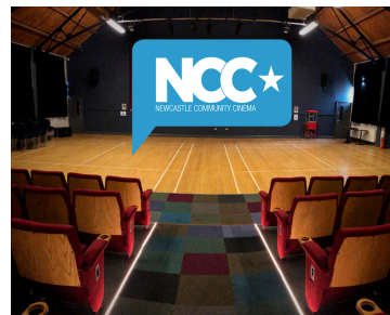
Newcastle Community Cinema

NCC is both a cinema and a hub for community activities, arts & entertainment. They believe in a space for the whole community; their premises are centralised around the screening of film but also work equally as a regular hub & home for a hugely diverse selection of Newcastle's groups, clubs, teams & charities. NCC started life as a cinema and has since morphed into much more.